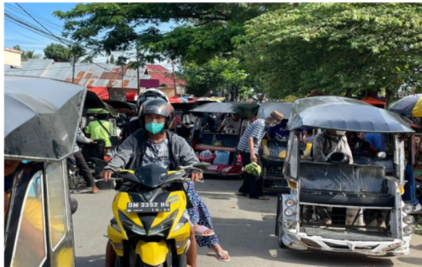
Motorized Pedicab as a Transportation Mode in Gorontalo City

This data differs from those the Gorontalo City Police collected, which showed that approximately 10,000 motorized pedicab units were operational, while 32,000 units operated independently. This motorized pedicab that operates is illegal because no permit allows its usage.